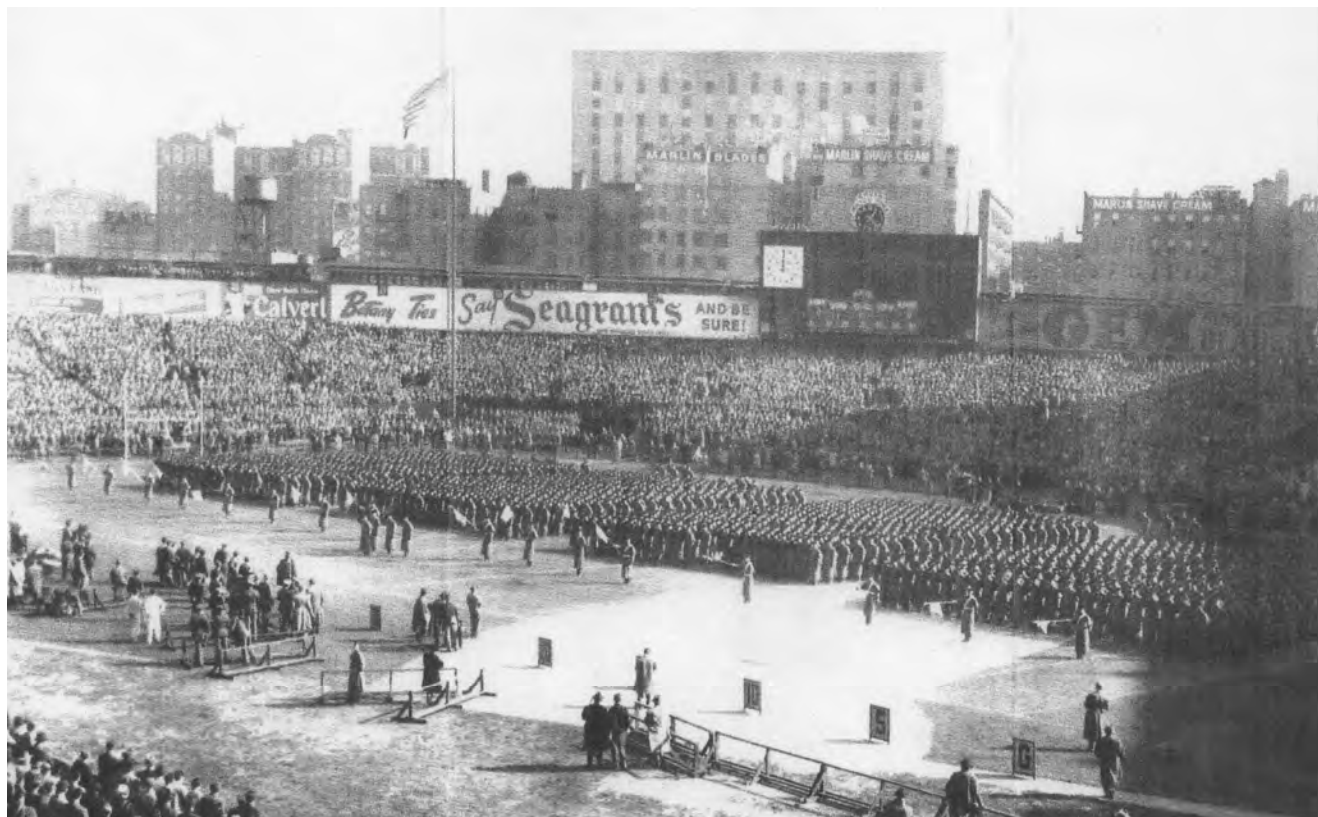
Cadet Brigade Commander leading the Corps of Cadets at the 1943 Army-Notre Dame game

I did not like doing it and have never forgotten that episode, in which I had to be reminded of my duty.