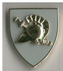
Cow - Gray