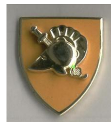
Yearling - Yellow

The full dress coat was adopted in 1816 and has remained the same throughout the years. It is of swallow-tailed style and many of the small details of 1816 still persist today: black silk core on the breast, cuffs and coat-tails in herringbone form and three rows of gilt bullet buttons. This coat is made by hand in the Cadet Uniform Factory by highly skilled tailors in much the same manner as their predecessors did a century and a half ago. The cadet white uniform has been here since 1886. White pantaloons of various cuts and designs have been worn at the Military Academy since 1802. Authorized in 1913 and redesigned in 1959 to provide for conventional length and single rear vent, the current white uniforms are used today primarily for social occasions during the May- September period. At the summer Camp Buckner encampment, they are worn for Saturday inspections and parades.