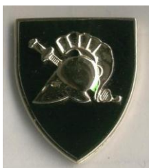
Firstie – Black

Cadets at West Point spend much of their time at the Military Academy in some type of uniform or other. There is a different uniform for just about every activity and phase of a cadet's daily program. The basic uniform is the dress gray uniform. In 1889, the gray blouse, trimmed down the front, around the bottom and up the back with black mohair braid one inch wide, was adopted to replace the gray shell and riding jackets. This same coat is worn today as a semi-dress uniform with either white or gray trousers. For many years after 1889 it was the coat the cadet knew best, for he wore it to class and for most of the day.