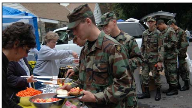
Parents tailgating at Army football game