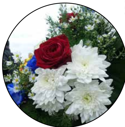
A lovely detail on the AWON wreath presented at Henri-Chappelle American Cemetery and Memorial.