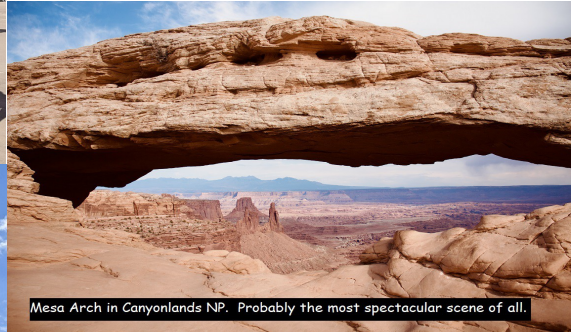
Mesa Arch in Canyonlands NP. Probably the most spectacular scene of all.