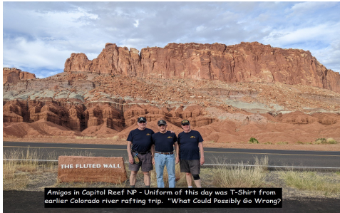
Amigos in Capitol Reef NP - Uniform of this day was T-Shirt from earlier Colorado river rafting trip. "What Could Possibly Go Wrong?"