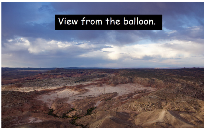
View from the balloon.