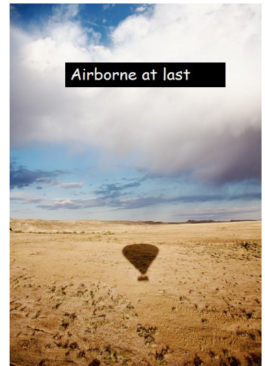
Airborne at last