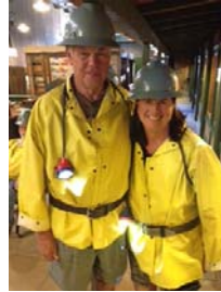
Queen Creek Mine tour, Bisbee, AZ