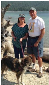
Us & Willow at Redfish Lake, ID