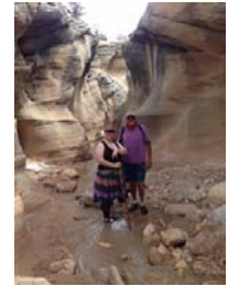
Paisley & Preston slot canyon hike Grand Staircase NM, UT