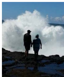
The wave that almost got us