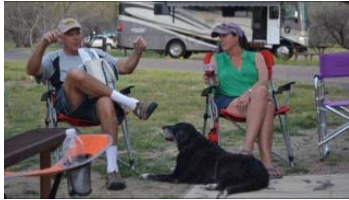
Catalina State Park, AZ