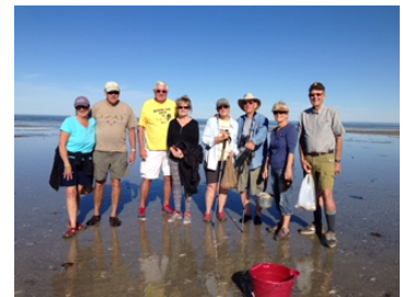
Hunting for sand dollars at Cholla Bay in Mexico