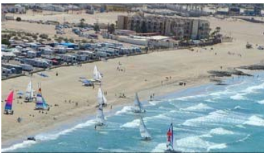
Playa Bonita at Puerto Penasco, Mexico