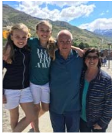
G'parents day with twins