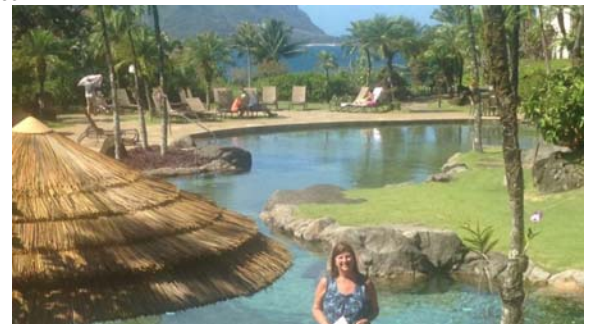
Our favorite place – Hanalei Bay Resort