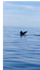
A whale Tail Sea of Cortez, Mex