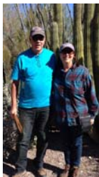
Us at Organ Pipe Cactus NM, AZ