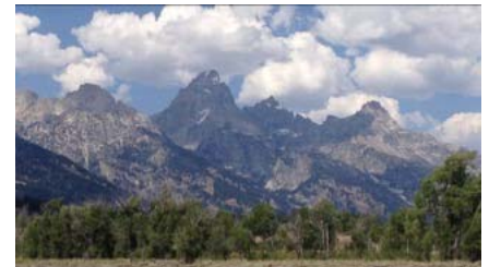
The Grand Tetons, WY