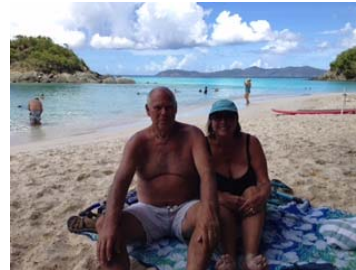
Snorkeling at Trunk Bay near St. Thomas, USVI