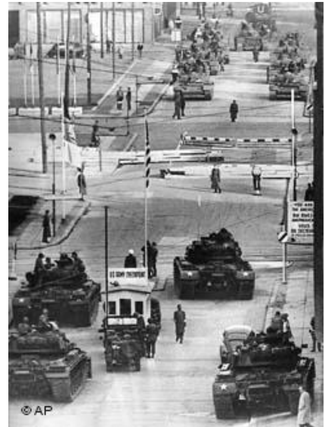
Fred Easley's Tank Platoon faces 10 T-55 Russian tanks at Checkpoint Charlie, August 13, 1963