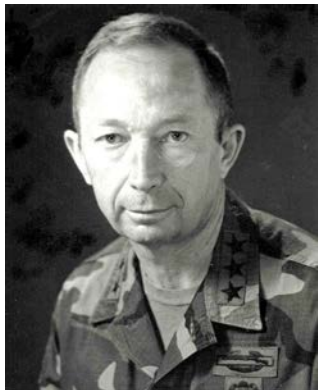
Graves, III Corps CG