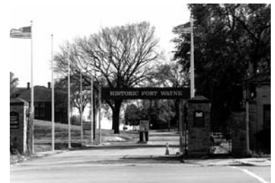
Entrance to Historic Fort Wayne.

For more information, visit http://www.historicfortwaynecoalition.com .