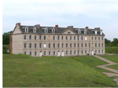
Original Barracks at Fort Wayne.