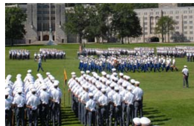
Class of 2012 Awaits Orders to Join the Corps.

such as financial support to the Superintendent's fund which is used to finance