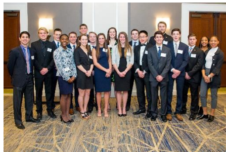
Admitted Candidates WP class of 2022.