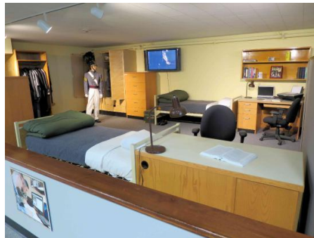
Warning, the cadet room display may give some of you "flash backs"!