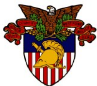
USMA Founded 1802