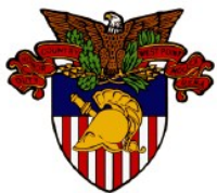
USMA Founded 1802