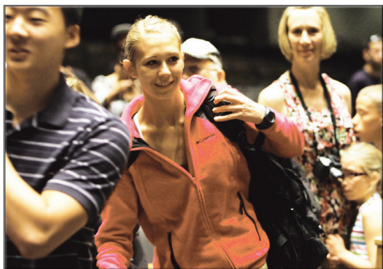
A new cadet starts her journey on R-Day.

If you complete college-level courses before entering West Point, you may be able to validate your course work to obtain advanced placement, but you must complete four full years at West Point in order to graduate. Participating in school, church, scouting and community activities will help you build a strong foundation in leadership. Active participation in sports is, by far, the best preparation for West Point's rigorous physical-development program.