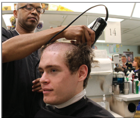
A new cadet gets the standard male haircut on R-Day.

The international cadets are from the countries of Afghanistan (2), Bulgaria, Gabon, Guyana, Haiti, Kazakhstan (2), Malaysia, Mongolia, Philippines, Qatar, Saudi Arabia, and Thailand. Upon graduation, those cadets will return to their countries as officers in their respective armed forces.