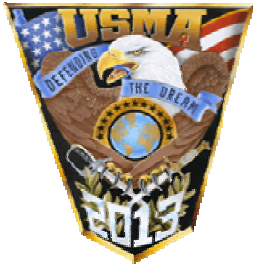
Class of 2013