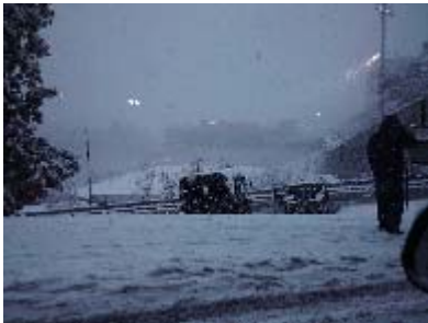
Mitchie Stadium before the Game