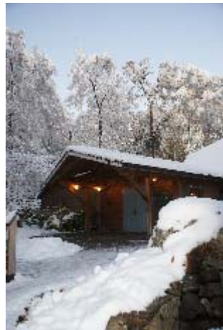
Outside the Lodge