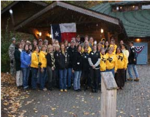
The Tailgate Group