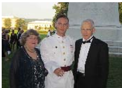
Ring Weekend with Grandparents