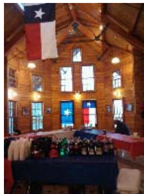
3 T Cathedral