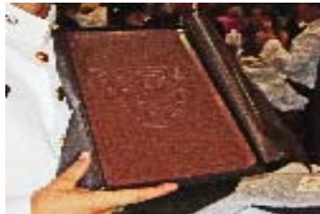
Chocolate of Crest from Ring Weekend