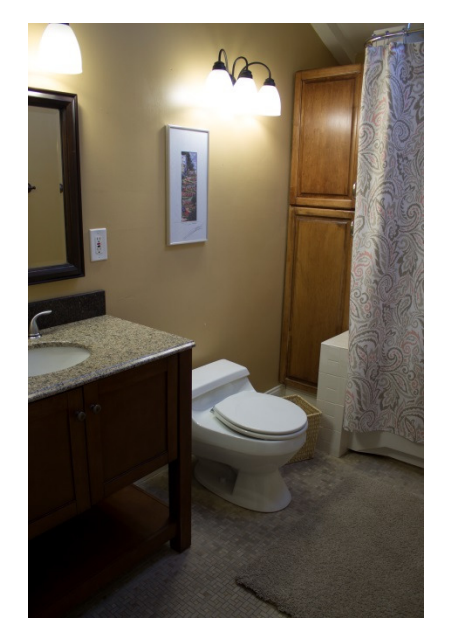
Guest Bedroom Bathroom