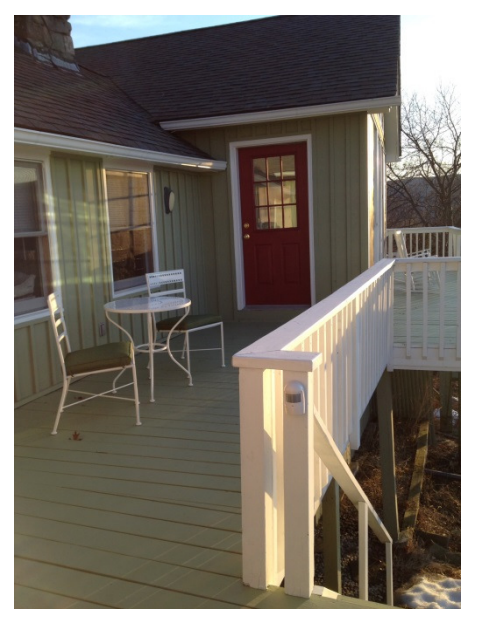
Deck off Den