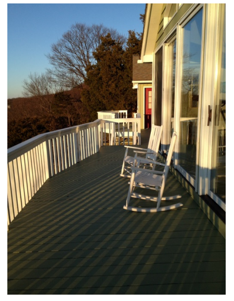
Deck off Great Room