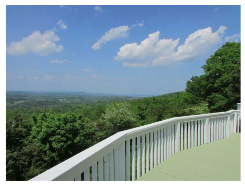
Partial View from Deck off Great Room