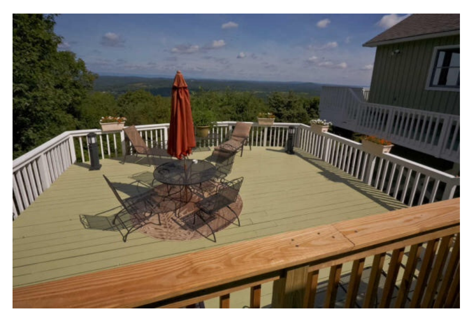
Main Deck off Kitchen