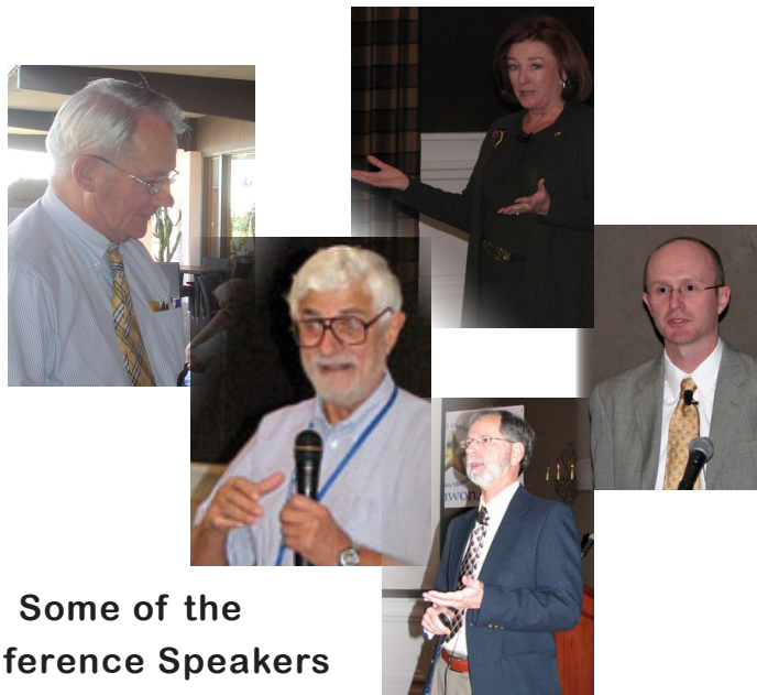
Some of the Conference Speakers