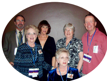
9 ID Kids