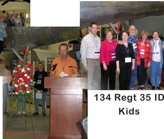
134 Regt 35 ID Kids