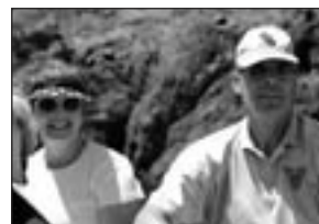
1965—Mini raft trip.

ner—were planned so that everyone would have maximum free time to enjoy the sights and sounds of the Vegas area. Many classmates had made prior reservations with other classmates to see some of the top-notch Vegas shows or they took walking tours of the major Strip casinos and other sights. Others participated in preplanned Red Rock Canyon and Spring Mountain Ranch caravans, the golf outing on Friday morning and/