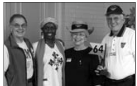
1964—Leavenworth Founders Day.