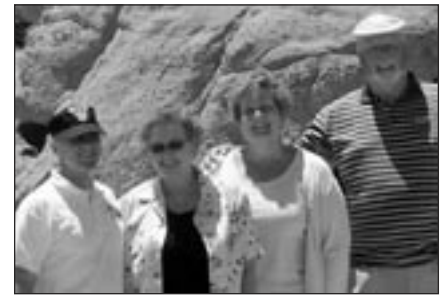
1965—Mini raft trip.

The three scheduled events—Wednesday night Benny Havens, Thursday morning breakfast and Saturday night class din-