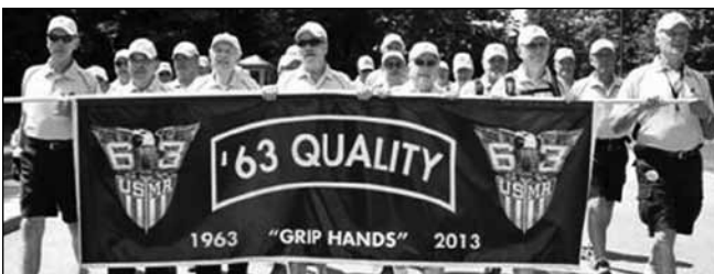
1963—'63 proudly displays our banner at the end of the March Back.