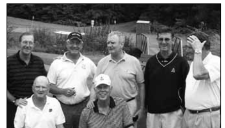
1964—Survivors at West Point Golf Course.