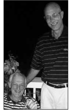
1964—Tonto and Nip at the Andersons.