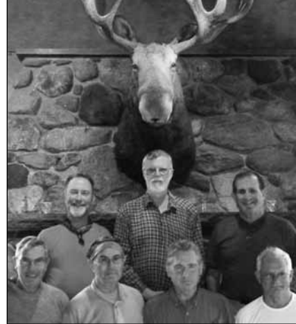
1964—Hikers and Friend.