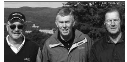
1964—Golf at Garrison with West Point in the background.