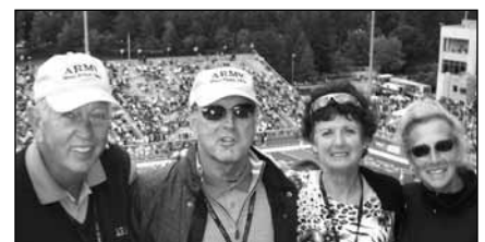
1964—And yes, there was a football game.