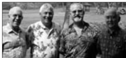
1964—Ft. Shafter Lunch Bunch.