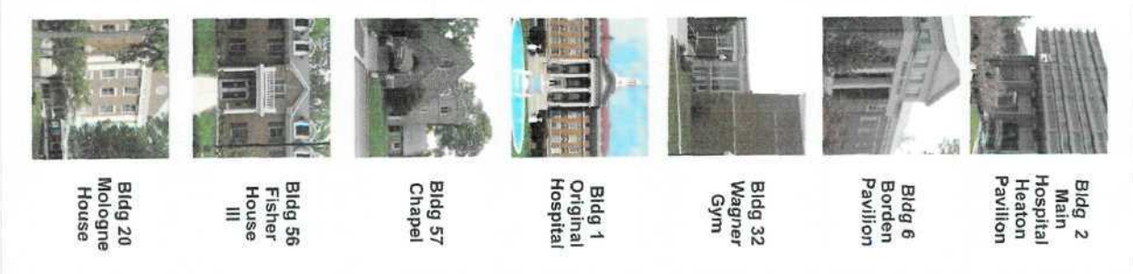
Bldg 2 Main Hospital Heaton Pavilion Bldg 6 Borden Pavilion Bldg 32 Wagner Gym Bldg 1 Original Hospital Bldg 57 Chapel Bldg 56 Fisher House III Bldg 20 Mologne House

Information (202) 782-3501 Fire (202) 782-3317 WRAMC Police (202) 782-7511